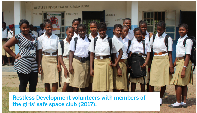
Restless Development volunteers with members of the girls' safe space club (2017).

International donors, the government, and private companies involved in expanding access to solar technologies often cite the importance of including women as sales agents and consumers. Yet these approaches tend to focus on individual adult women, with limited attention to either the potential for cooperative uses of technology or to adolescents' potential roles as either energy consumers or future professionals. At the same time, adolescent girls' "safe space" programs are a common form of NGO